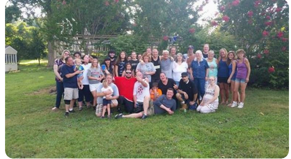
We all love and will miss you.